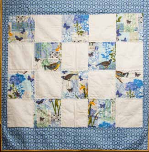
1st Prize: Bluebirds Quilt Donated by The Thursday Friendship Group at Addicted to Fabric

Money raised will support NEWACT Bursaries